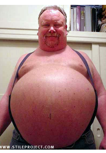
THE END. NO MORE. ALL GONE.